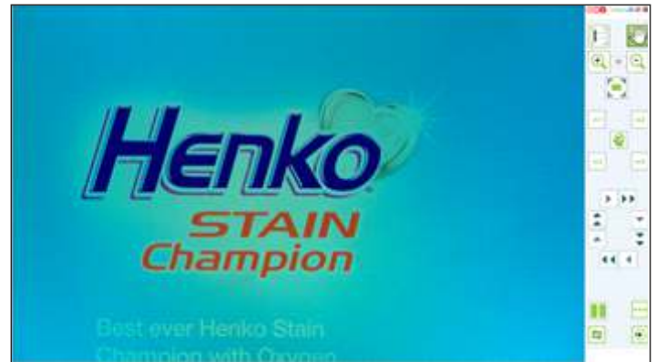
ViewAXIS Mega – home screen