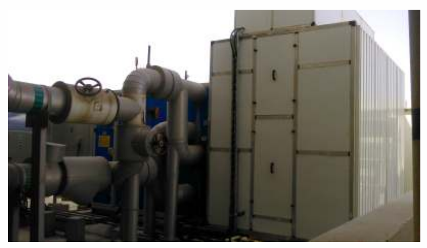
Installation of HMX-PCU at Al Waha towers.

Al Waha tower had two FAHUs installed (capacity: 30,000 CFM each) to treat their 15% make-up fresh air. The FAHU cooled and dehumidified the make-up fresh air from the ambient 50°C to 15°C. The FAHU tonnage consumption for this was 510 TR/Hr. In spite of the fresh air quantity being only 15%, the tonnage consumed was almost 30% of the entire chiller load. This meant less available tonnage for cooling the recirculated air and therefore, inadequate cooling for the fresh air being supplied.